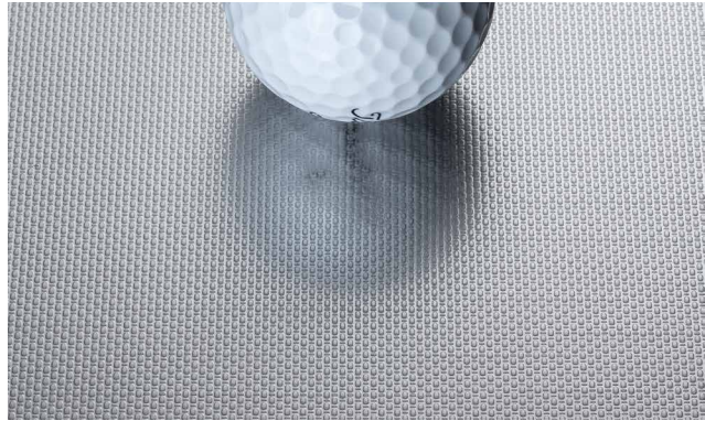
Fig. 3. Deco Linen Matt.