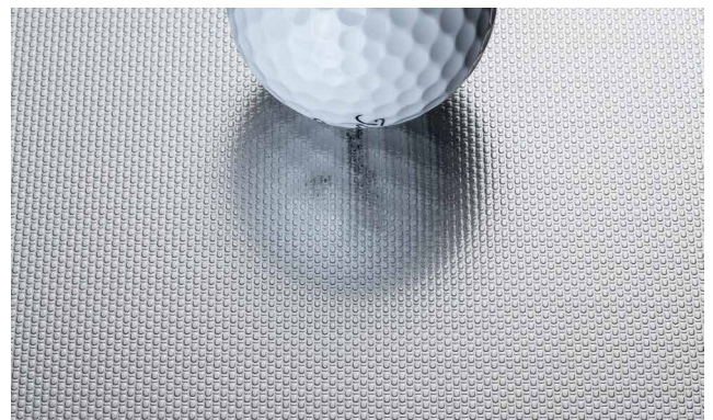
Fig. 2. Deco Linen Star.