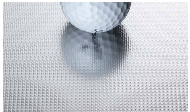
Fig. 1. Deco Linen.

Compared to the standard Deco Linen this high-end Linen version goes through an additional production process which adds a very fine texture upon the pattern structure resulting in a more sparkling finish with slightly lower reflectance.