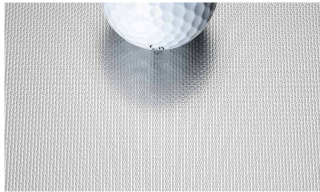
Fig. 3. Deco Linen Matt without Slubs.