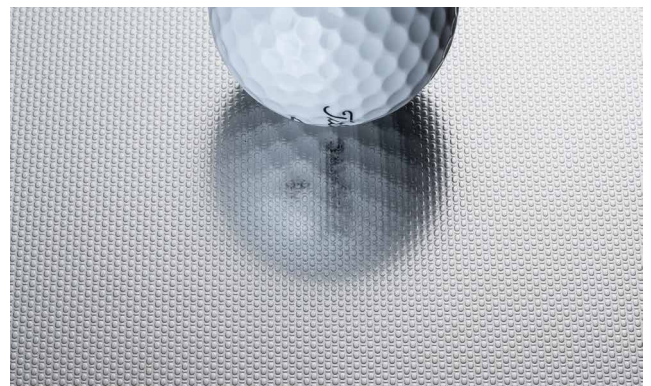
Fig. 1. Deco Linen without Slubs.

In order to either fulfill specific glare regulations or meet an architect's particular taste, Outokumpu offers Deco Linen without Slubs with four different gloss characteristics. Besides the standard Deco Linen without Slubs which has the highest reflection, the lower reflecting versions are called Deco Linen Star without Slubs, Deco Linen Matt without Slubs and Deco Linen Supermatt without Slubs.