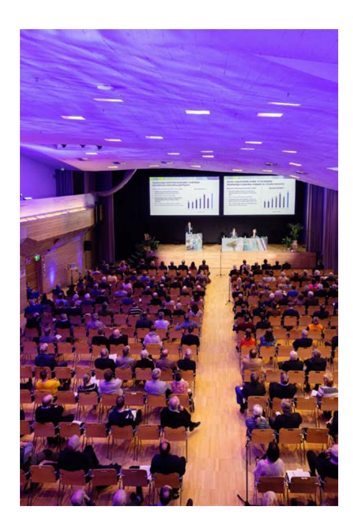
Outokumpu Oyj's Annual General Meeting 2023 was arranged in March 2023 at the Dipoli congress center in Espoo, Finland.

Outokumpu Oyj, the Group's parent company, is a public limited liability company, listed on Nasdaq Helsinki and incorporated and domiciled in Finland. Its headquarters are located in Helsinki. In its corporate governance and management, Outokumpu Oyj complies with the laws and regulations applicable to a Finnish public company, the company's Articles of Association and the Corporate Governance Policy approved by the company's Board of Directors.