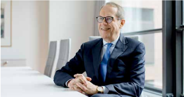
Chairman of the Board of Directors