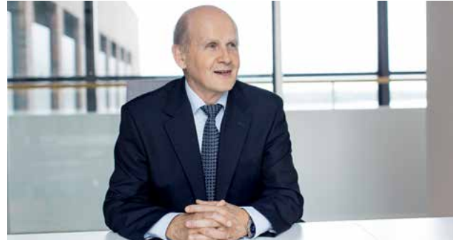
Vice Chairman of the Board of Directors

Chairman of the Board; Xinova Management Company LLC 2016– Chairman of the Board: Miltton Oy 2015– Chairman of the Boards of Directors and the Supervisory Boards: The Research Institute of the Finnish Economy ETLA and Finnish Business and Policy Forum EVA 2005–2017 Vice Chairman of the Board: Otava Ltd 1996– Board member: TBG AG 2016– Board member: Tetra Laval Group 2013– Board member: University of Helsinki 2009–2017 Advisory Partner: Perella Weinberg Partners 2014– Independent of the company and its significant shareholders.