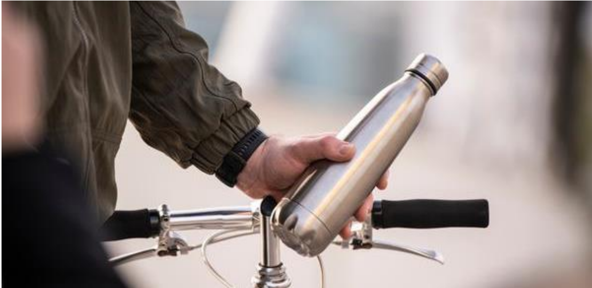
Figure 2 We produce stainless steel that can be used in various applications