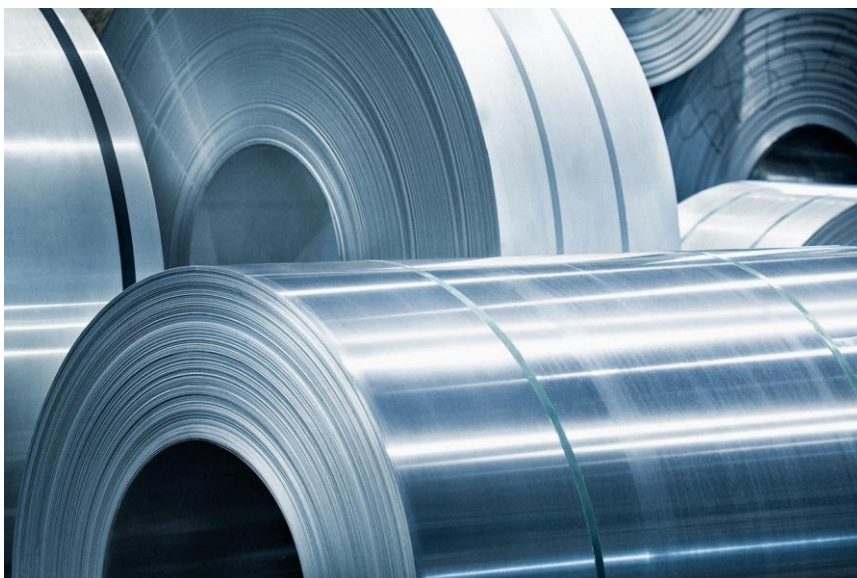
Figure 3 Cold rolled coil