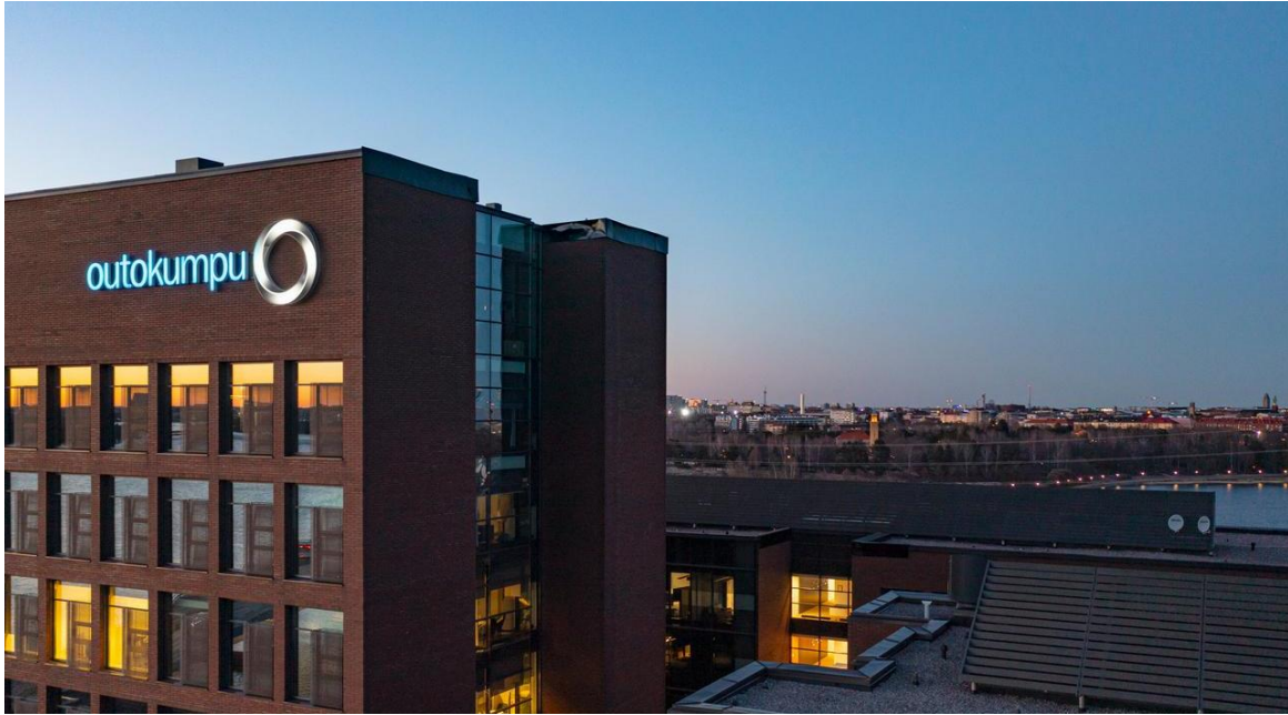
Figure 1 Outokumpu headquarter in Helsinki, Finland