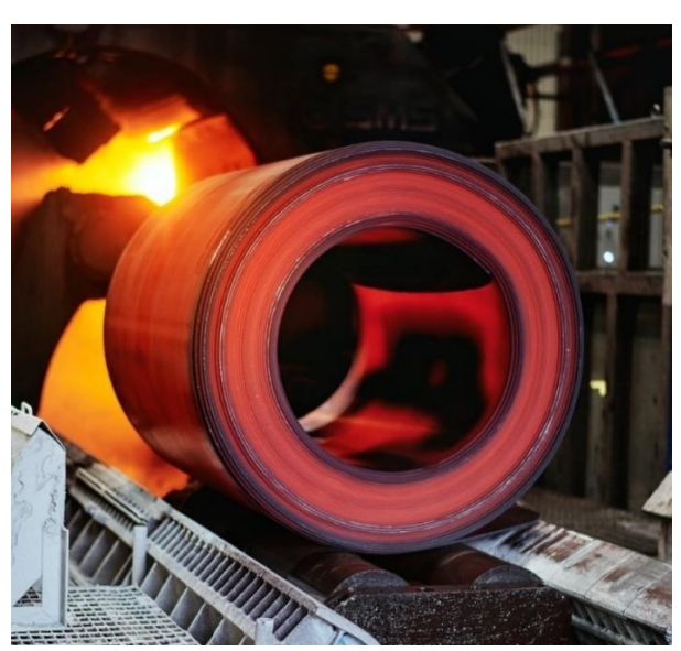
Figure 3 Hot rolled coil