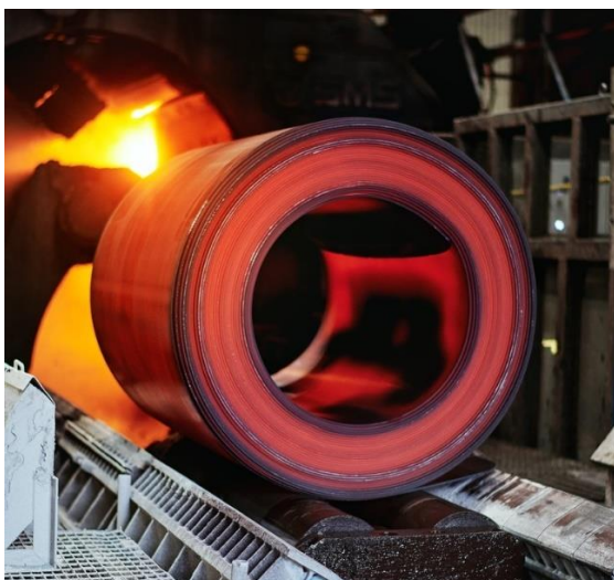
Figure 3 Hot rolled coil